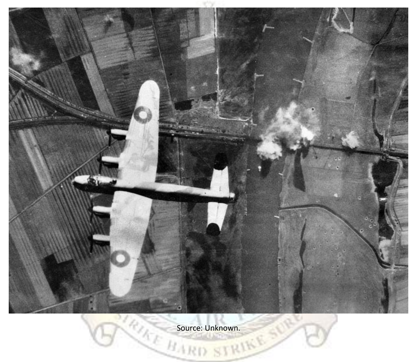
TTN Online Campaign Campaign 4, Mission 7 – Stettin, Germany – 2/3 Dec. 1944 Overall Stats